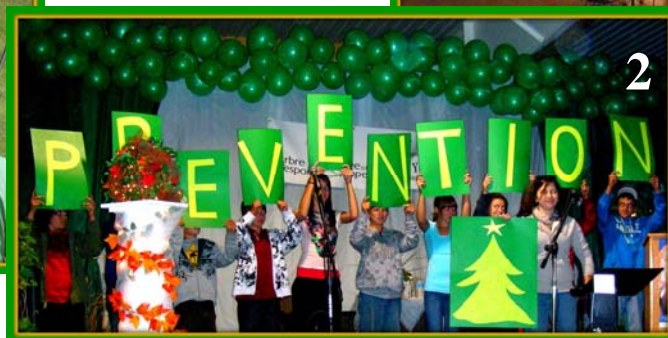
2 – Tree of Hope Campaign launch

It is thanks to devoted people like you that we are able to offer higher quality healthcare to cancer patients. Keep up the good work!