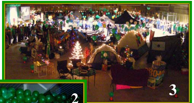
3 – Rogersville's Marche de l'espoir (walk of hope)