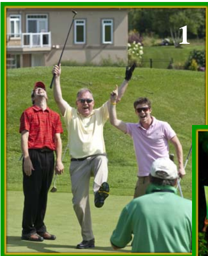
1 – 8 th Scotiabank-BMW Moncton Tree of Hope Classic

A few pictures of Tree of Hope Campaign activities that were held recently: